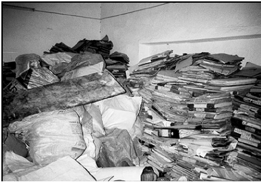
Bags filled with archival documents in a mosque*