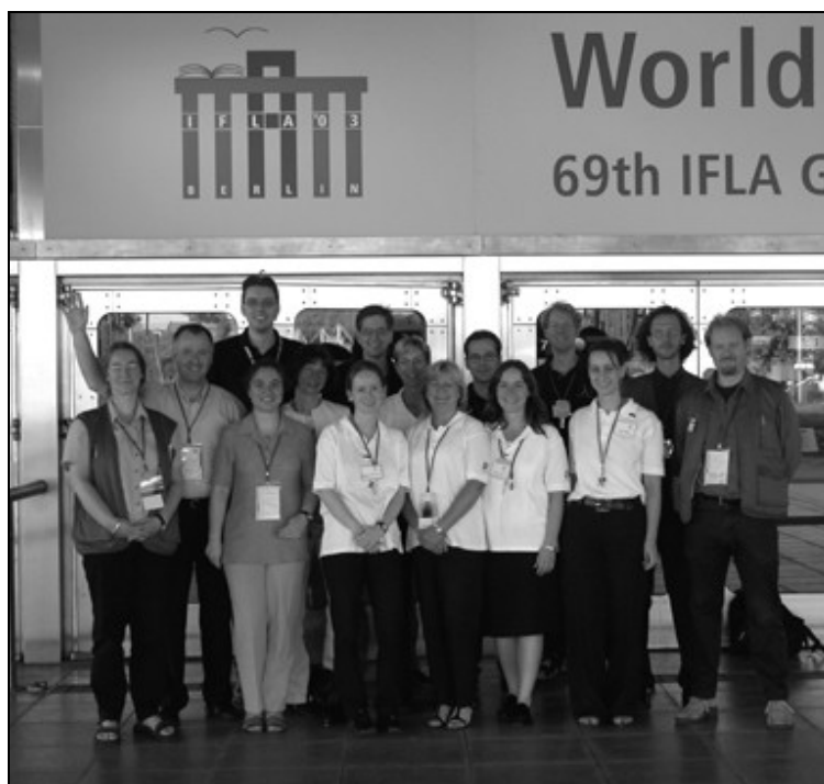
They made the Conference a success: IFLA 2003 Secretariat, K.I.T. GmbH, Lambda Lodgic and the 200 volunteers

Further information: LIBCOM-2003 Organizing Committee, 12 Kuznetski most, Moscow, 107996, Russia. Tel: +7(095) 923-9998, +7(095) 928-1340, +7(095) 292-5581, +7(095) 923-1249. Fax: +7(095) 921-9862, +7(095) 925-9750. E-mail: libcom2003@gpntb.ru – general requests; libcom.rus@gpntb.ru – regional manager for Russia and CIS participants; libcom.world@gpntb.ru – regional manager for other countries.