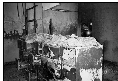
National Library, part of the stores*