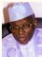
Mr Adama Samassékou

President of WSIS Preparatory Committee for Geneva Phase President of the African Academy of Languages Former Minister of Education of Mali (1993-2000)