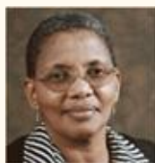
Ms Ntombazana Botha

Ntombazana Botha is the Deputy Minister of Arts and Culture of the Republic of South Africa since 29 April 2004. She is a member of the portfolio committees on Justice and Constitutional Development, Improvement of the Quality and the Status of Women and Finance. In her former post, as Deputy Minister of Provincial and Local Government, Botha started the Women in Local Government programme, aimed at helping female councillors overcome past disadvantages and take a leadership role in development at local government level. Botha helped establish the United Democratic Front in the Border region of the Eastern Cape in 1983. She served as vice-chairperson of the Eastern Cape NGO Coalition in 1996 and 1997, and joined Parliament in July 1997. From 1991 to 1997 she was coordinator for the Lawyers for Human Rights paralegal training project at regional, provincial and then national level.