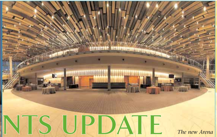
The new Arena