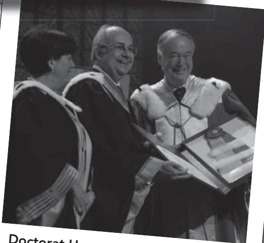
Doctorat Honoris Causa

"As delegates, you bring to this conference your cultural background, professional practice and special expertise which you will share during the next five days through the many sessions and activities. The main characteristic of this conference is diversity. The current globalization process is irreversible and extends beyond all borders. We all hope that it takes place in a climate of dignity and respect. Full recognition of diversity is the key to helping us navigate the path to global understanding. This is what the theme proposed by the national committee is all about."